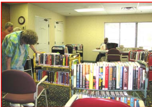
Carts loaded with a wide selection of books can be rolled in to accommodate Extension Services customers.

If you live outside of the free delivery area, you may still be eligible for Extension Services. A non-resident fee will apply. Call Extension Services at 217-753-4900, x220 for the current annual fee and to see if you are eligible.