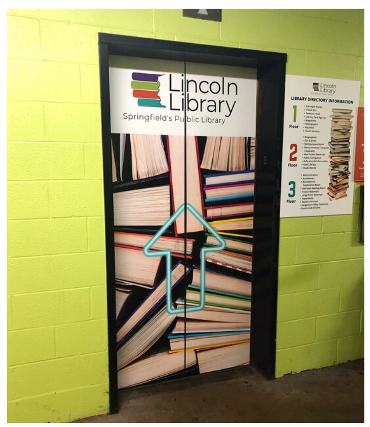
New elevator wraps brighten up the parking garage