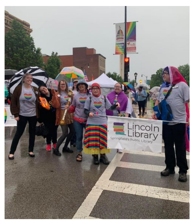
Staff members brave the cold rain at Springfield Pride