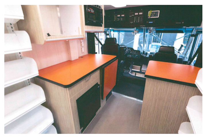
Top: A provided mock-up of what the mobile branch will look like

Middle: An example of a potential interior space, with shelving for 3,500 materials