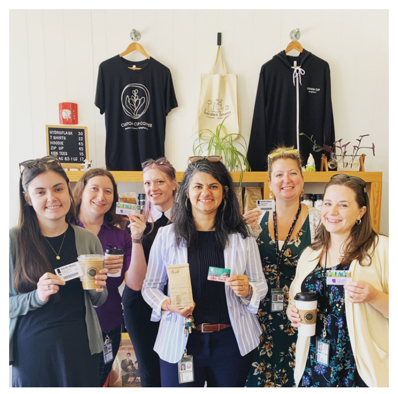
Library Card Month partnerships with downtown businesses were a success.