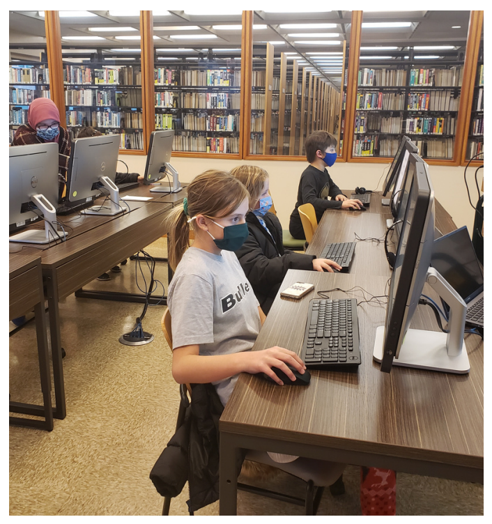
Young coding masters practice for World Coding day.

Making the Library a Place the Whole Community Can Enjoy