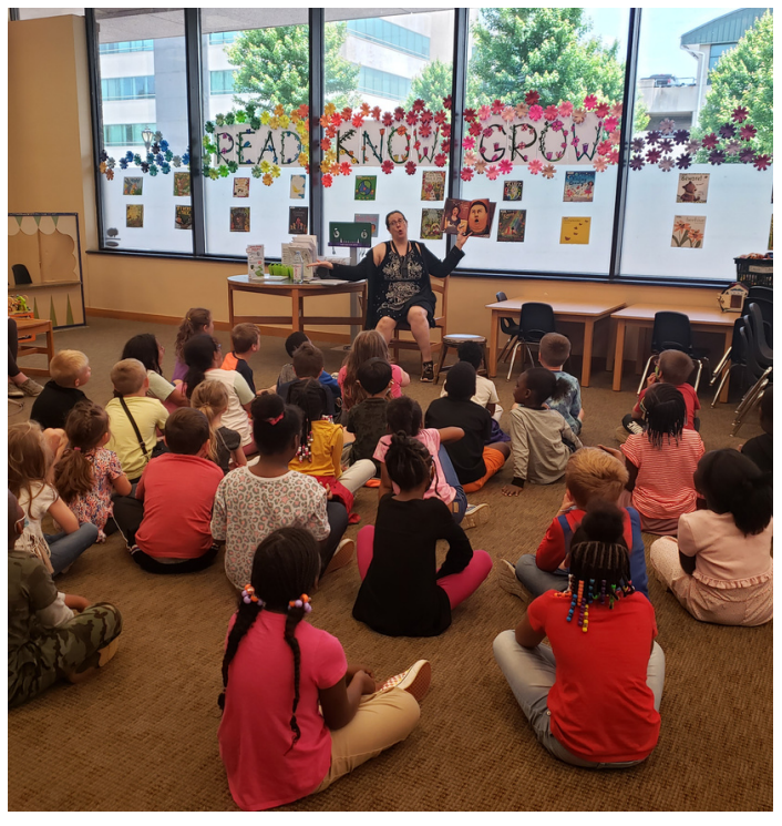
Lincoln Library staff host elementary students for an amazing story time.