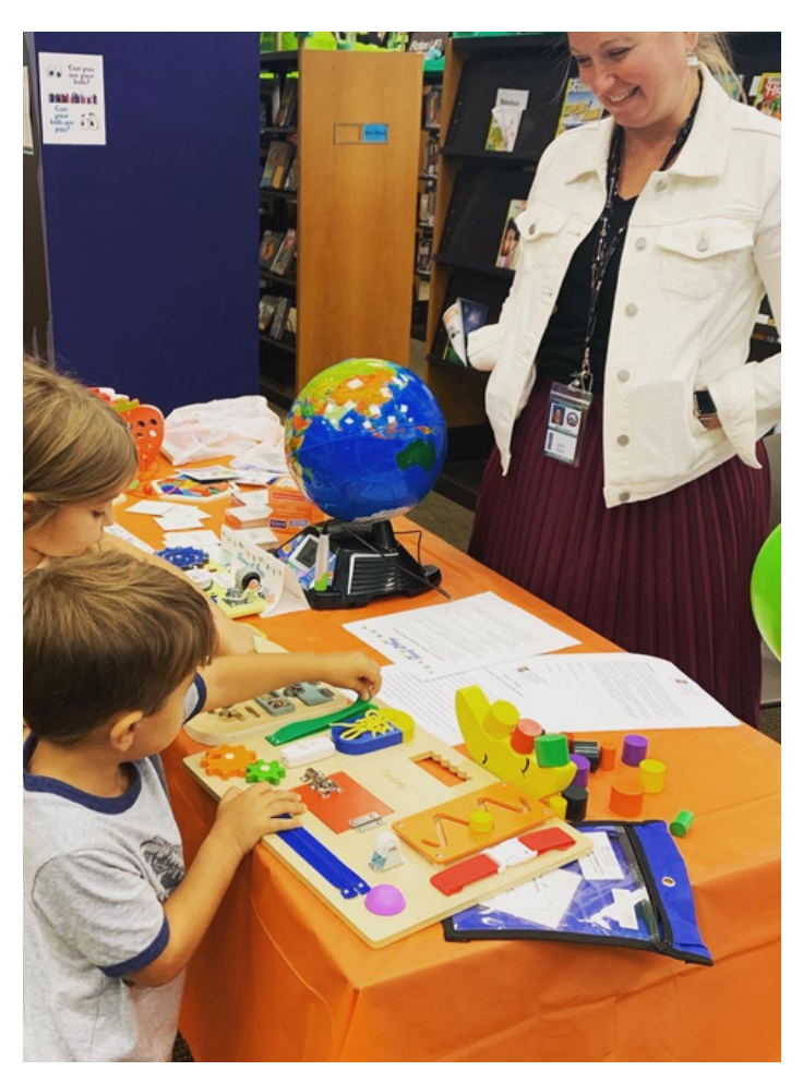
Children browse toys and games at the Library of Things Petting Zoo event