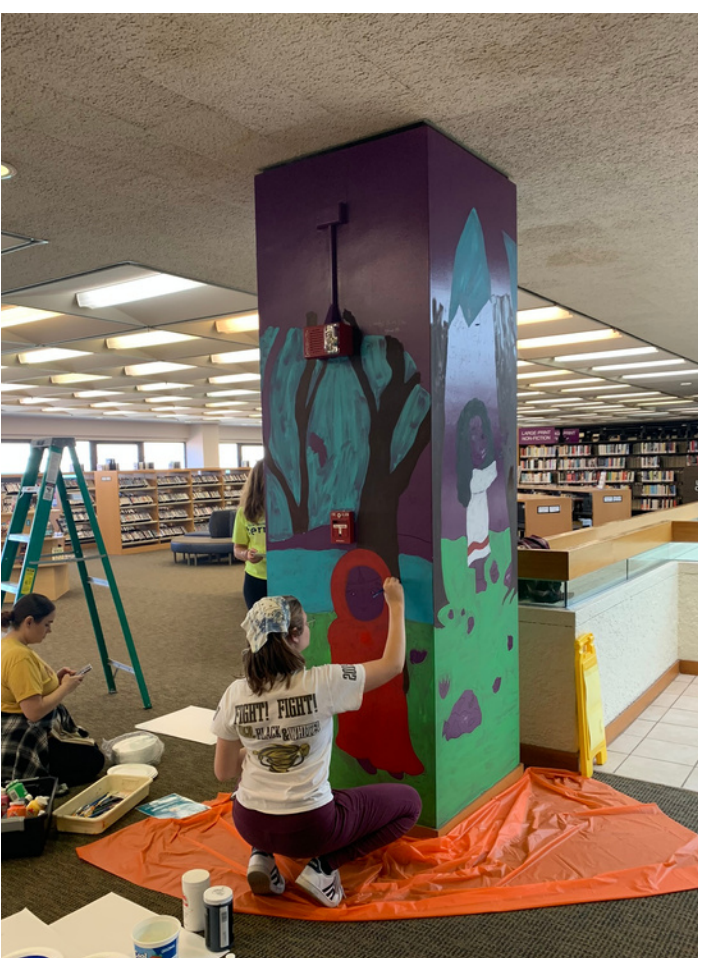
Sacred Heart-Griffin High School art club students paint a mural on the third floor