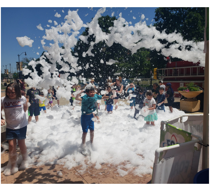
Summer Reading Bubble Bus Wrap Up Party was a blast